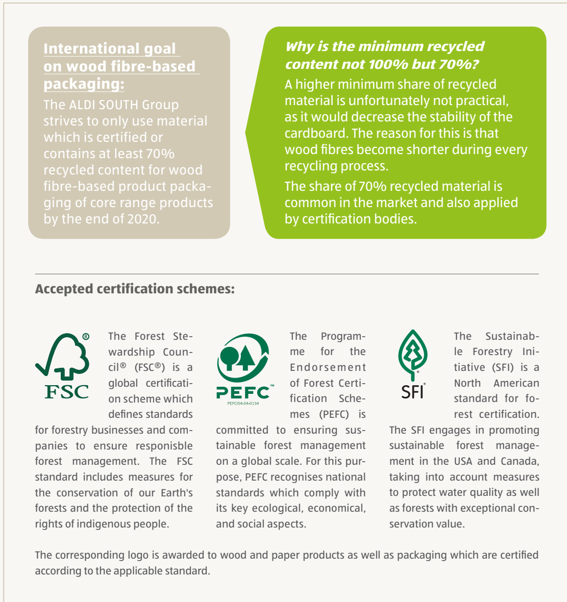
Figure 4: International goal on wood fibre-based packaging of the ALDI SOUTH Group