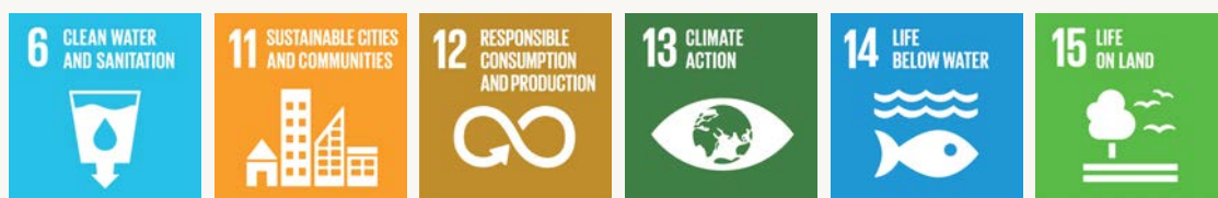
Figure 1: Selected UN Sustainable Development Goals related to product packaging (Source: United Nations 2016)

Against this background, the topic of more sustainable product packaging is high on the agenda of industry players worldwide. Our aspiration is for all of our product packaging to be designed in the most sustainable way possible.