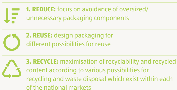
Figure 6: Levels of the waste hierarchy on which our guideline for environmentally responsible product packaging focuses

Our guideline follows the three most important levels of the waste hierarchy referred to in '2.1 Environmentally responsible packaging' (Figure 3):