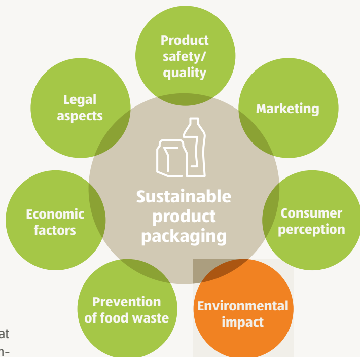
Figure 2: Factors to be considered for sustainable product packaging

These two examples demonstrate that detailed consideration of the different influencing factors on product packaging is necessary, and therefore product packaging needs to be evaluated on a case-by-case basis, in order to assess and improve its sustainability.