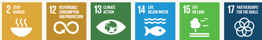
Figure 1: Selected UN Sustainable Development Goals related to product packaging (Source: United Nations 2016)

Our international structure, our market position, our decades of experience, and the daily commitment shown by our more than 100,000 employees provide us with the potential to make important contributions to more sustainable development. The 17 Sustainable Development Goals specified within the United Nations' 2030 Agenda for Sustainable Development require measures in various areas related to farm animal welfare (Figure 1).