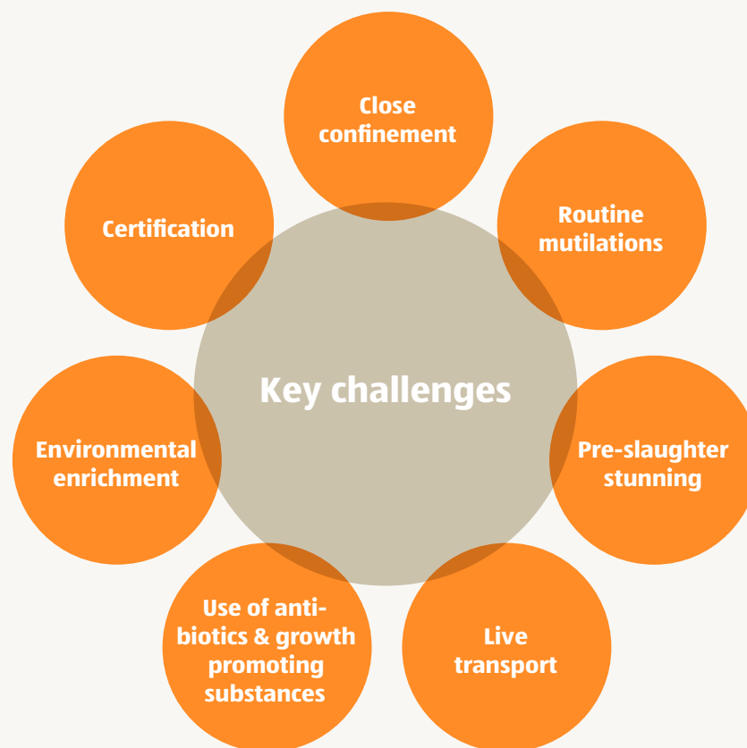
Figure 3: Key challenges to be addressed for improved animal welfare

Irrespective of the complexity of the topic of animal welfare – especially regarding our various products from different areas (fresh meat and dairy as well as textile and cosmetics products) which fall within this scope and the various markets we operate in – we are aware of the fact that there are a number of key challenges that need to be addressed by the entire industry. We are committed to continuously improving our supply chains with regard to key challenges such as those described below.